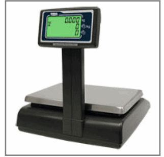
G-310/G-320 Pole Back